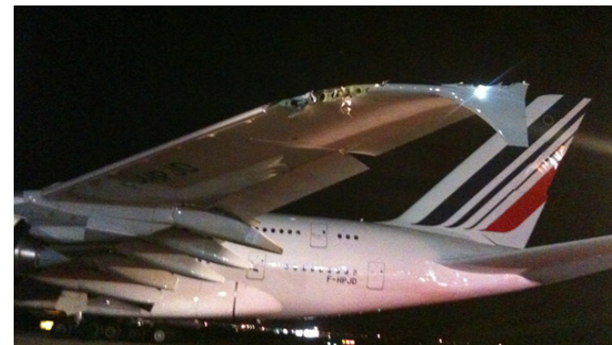
Damaged left wing of the Airbus A380. This is the larger plane that clipped the smaller plane with its wing.